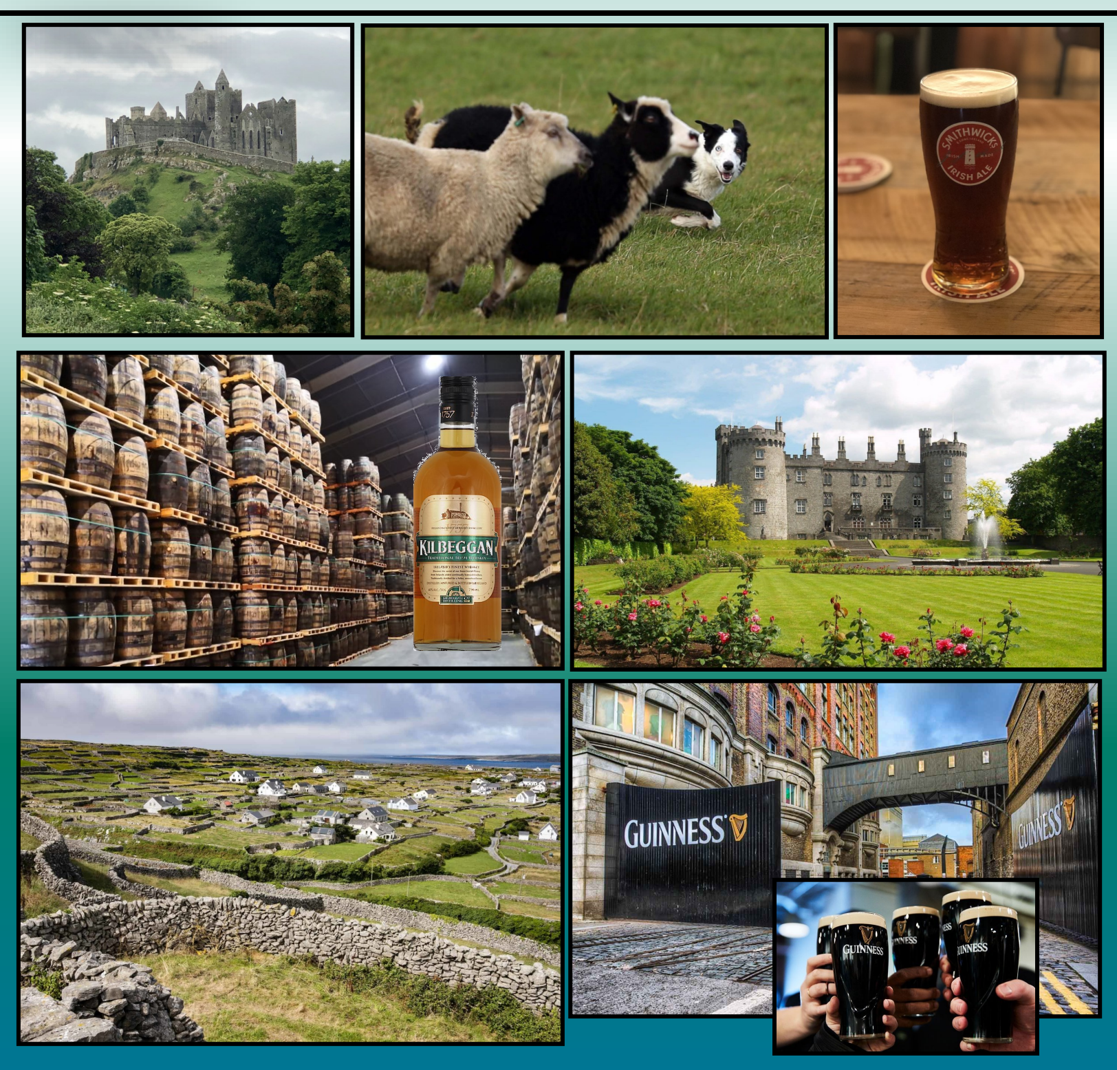
This is an exclusive travel program presented by InterTrav Corporation

$3,795 Per Person, Double Occupancy from Chicago